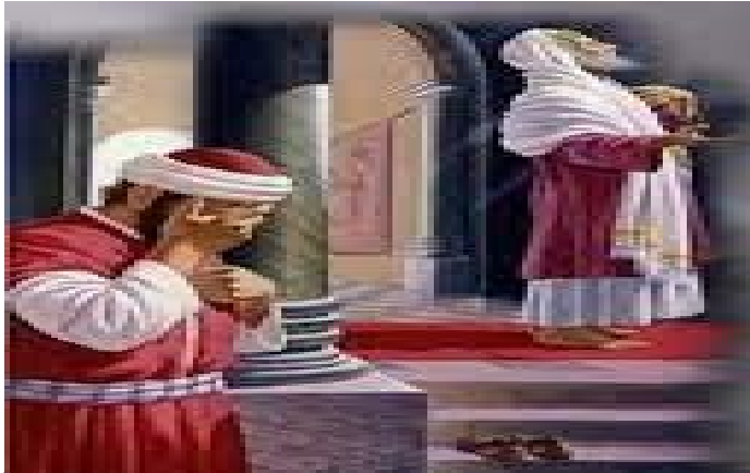
The Parable of The Pharisee and Tax Collector

Two Men, Two Prayers, Two Attitudes, Two Verdicts