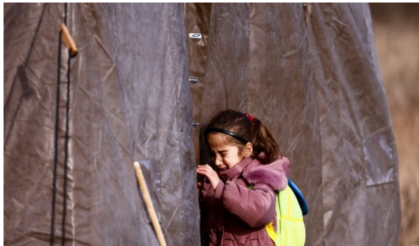
A child fleeing war in Ukraine at a temporary camp in Przemsł, Poland

“You were the first to support Ukraine, opening your borders, your hearts and the doors of your homes to Ukrainians fleeing the war,” said Pope Francis in his greeting to the Polish pilgrims present for the General Audience in the Paul VI Hall.